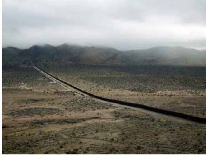
Richard Misrach, born 1949 Wall, Jacumba, California, 2009 El muro, Jacumba, California Pigment print

natural world, while Galindo is inspired by the Mesoamerican belief that one can bring out the spiritual essence of an object's past. Galindo's 260-minute composition Sonic Borders , which can be heard playing within the gallery, employs eight musical instruments the artist created from objects discarded near the border.