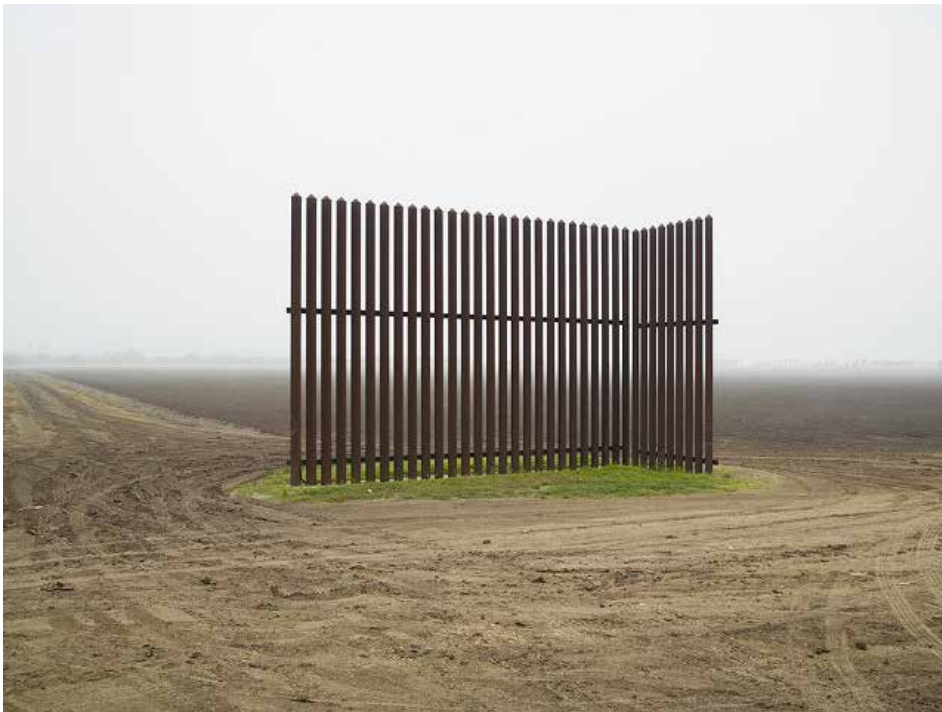
Richard Misrach, born 1949, Wall, Los Indios, Texas , 2015, printed 2017, From an edition of 5, Pigment print, Crystal Bridges Museum of American Art, Bentonville, Arkansas, Photo: Courtesy the Artist

A collaboration between American photographer Richard Misrach and Mexican-American artist and composer Guillermo Galindo, Border Cantos | Sonic Borders explores the complexities of the southern border through photography, sculpture, and sound, inviting us to bridge boundaries and initiate important conversations.